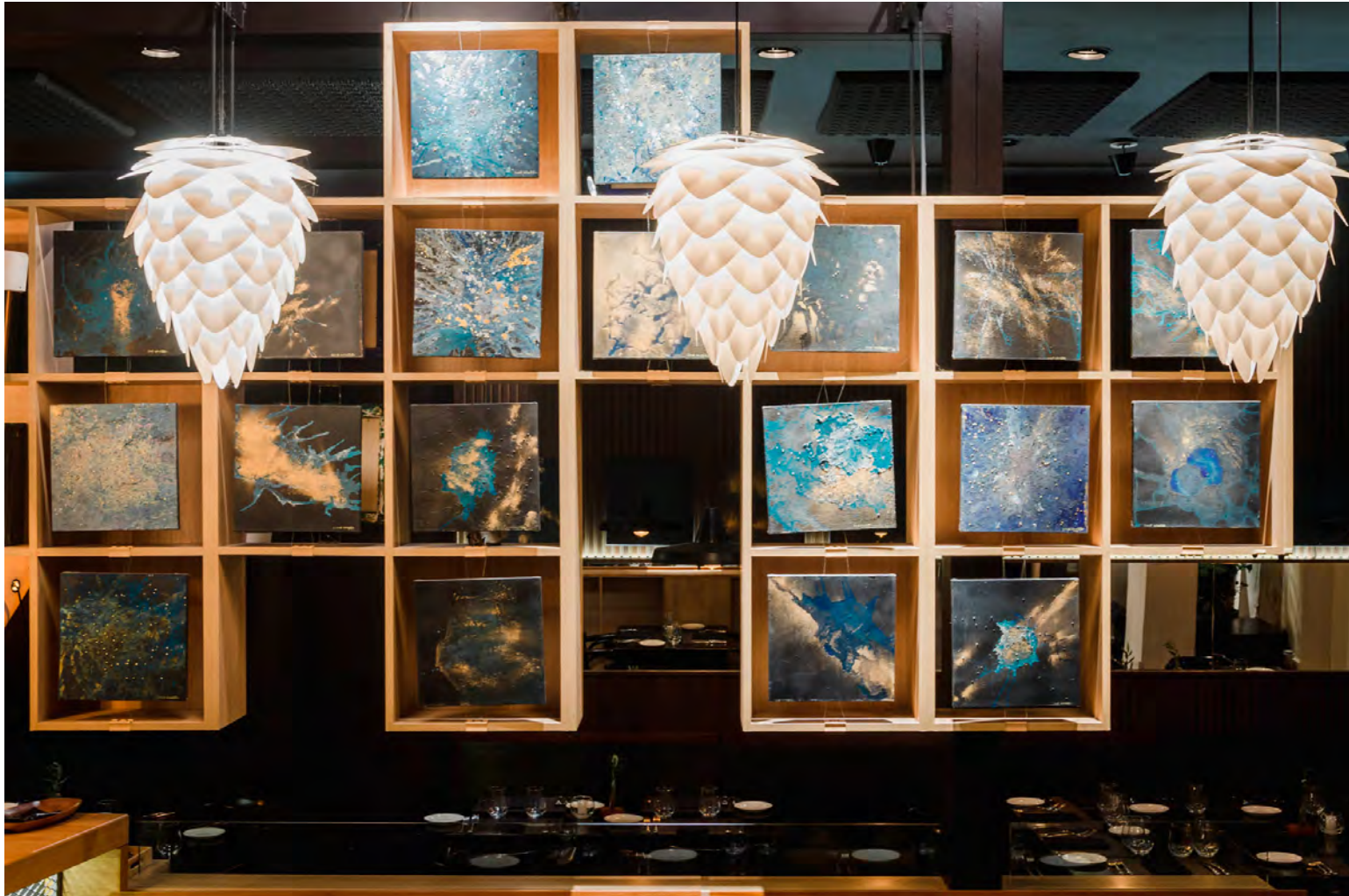
Amazonas | Presentation